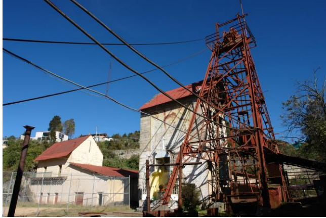
DOLORES MINE.

Rescuing the archives located in this mine has been an important step. After treating them to ensure the conservation of the information contained, they were transported to the archives concentration of AHMM.