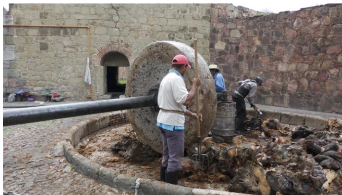
AGAVE MILL MEZCALERA.